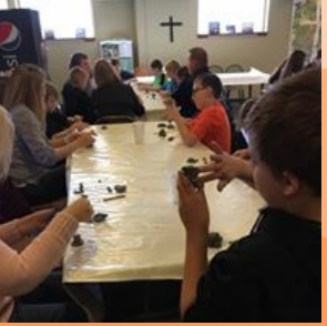
First Communion Chalice Making