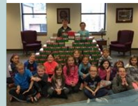
Operation Christmas Child Boxes