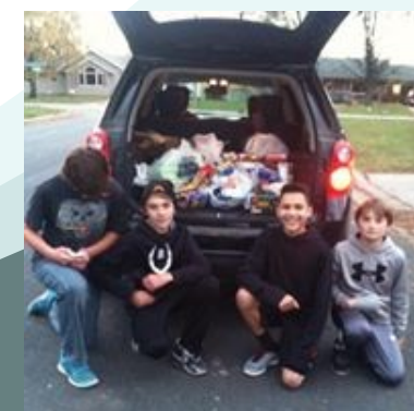
Trick-or-Treat for the Foodshelf