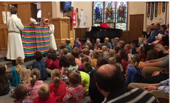
Faith Seeds with FLC Puppets