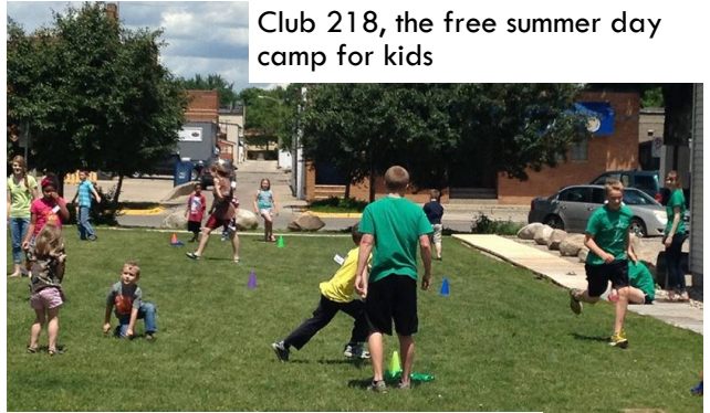
Club 218, the free summer day camp for kids

Through the Augustana District , Faith’s pastors have helped many new or struggling churches with supply preaching, consultations and ordinations.