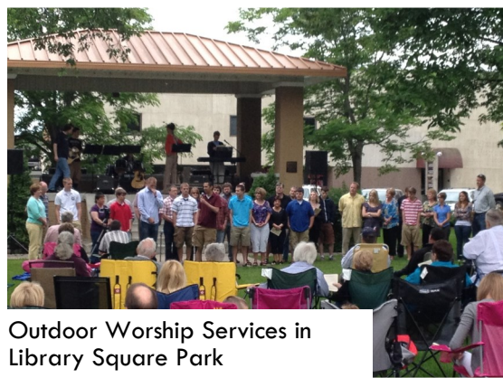
Outdoor Worship Services in Library Square Park