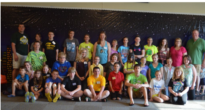
Parent and student volunteers at the preschool through kindergarten Vacation Bible School in June.