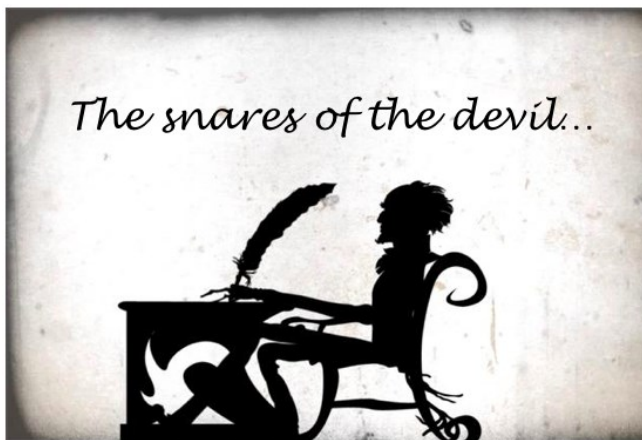
The Screwtape Letters and the Art of Temptation "...that they may escape from the snare of the devil, having been held captive by him to do his will" -2 Timothy 2:26

See Wendy Magruder after the services today or stop by the office this week to pick up your copy. The chapters covered each week will not go in order. You can start reading right away, but dig into chapter 12 on the "art of temptation" for Wednesday's sermon. Sermons will be posted on the website if you wish to listen to them a second time.