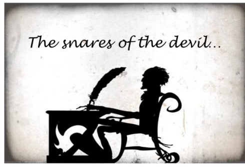
The Screwtape Letters and the Art of Temptation "...that they may escape from the snare of the devil, having been held captive by him to do his will" -2 Timothy 2:26

Are you a participating member of Thrivent and have Choice Dollars to allocate? You can still designate your 2017 Choice Dollars to Faith Lutheran Church through the end of March. You can do so by going online to Thrivent.com/thrivent choice, by calling 800-847-4836 or by contacting your Thrivent representative. From the beginning of 2017 through today, you have given $9,638 to Faith Lutheran church through this program. THANK YOU!