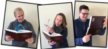
Making Sense of Scripture