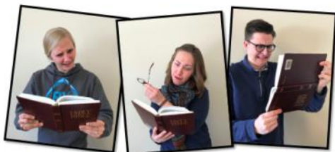
Making Sense of Scripture