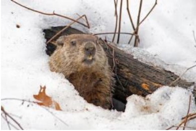
WHAT DOES THE GROUNDHOG SAY?