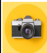
Photo Directory and Picture Update

Thank you to all of you (well over 300 households) who participated in the 150 th Anniversary Edition of the photo directory! We are hoping to have the directory completed and printed in time for the October 17 celebration.