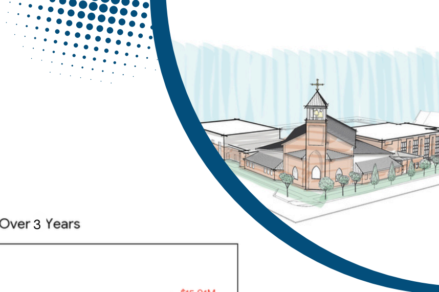
Inflation-Adjusted Target Over 3 Years